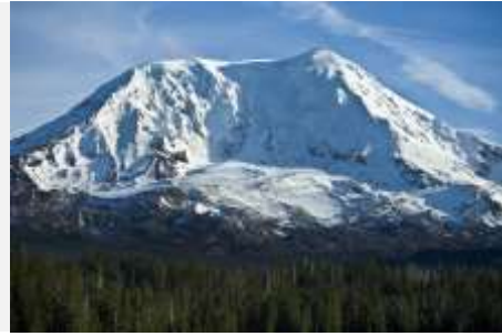
Mt. Adams, Gifford Pinchot National Forest and Yakama Reservation

Continue south to Toppenish, gateway to the Yakama Reservation and the Yakama Nation Cultural Center . Learn about the ancestral and modern-day ties this tribe has with Mt. Adams which looms to the west.