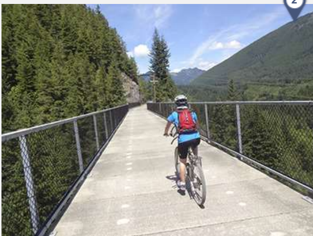
Snoqualmie Tunnel along the John Wayne Pioneer Trail, Mountains to Sound Greenway

Begin your journey headed southeast on the Mountains to Sound Greenway Scenic Byway (Interstate 90) through the Mt. Baker-Snoqualmie National Forest , taking in Snoqualmie Falls , Alpental Ski Area , and Kachess and Cle Elum Lakes along the way. Just before Ellensburg, turn south onto the Yakima River Canyon Scenic Byway , enjoying view of the Yakima River from Umtanum Creek Recreation Area and the Roza Recreation Area .