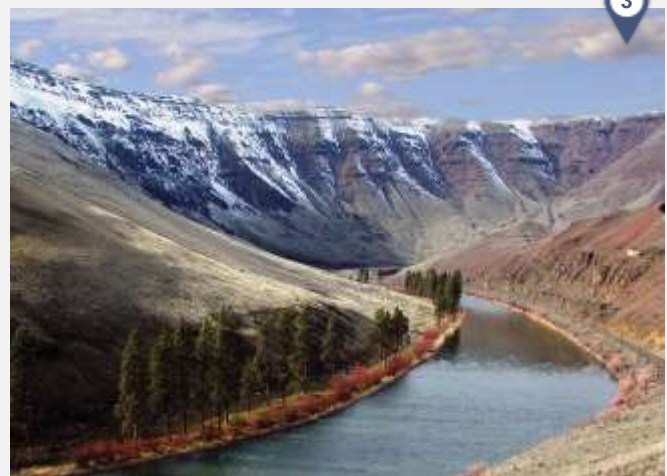
Yakima River Canyon, Bureau of Land Management