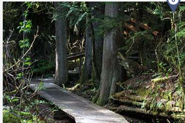
Boardwalk Trail at Federal Forest State Park, Washington State Parks