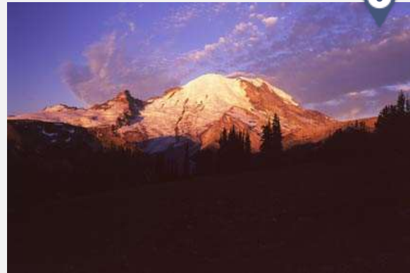
View of Sunrise on Mt. Rainier from Sunrise District, Mt. Rainier National Park