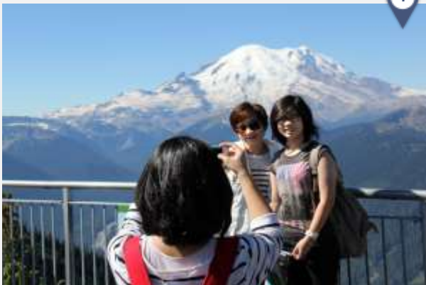
Photo Opportunity from Summit House, Crystal Mountain Ski Resort

As you make your return to Seattle, stop at Crystal Mountain Ski Resort for year-round outdoor adventure. Washington largest mountain resort features winter skiing and a gondola to alpine hiking and mountain biking in the summer. Conclude your trip with a stop at Federation Forest State Park to take in the beautiful old growth forest along the 12 miles (19.3 km) of hiking trails including 3 miles (4.8 km) that are family friendly.