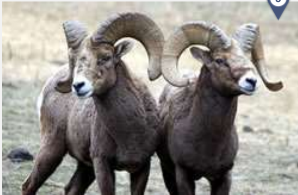
Bighorn Sheep, Oak Creek State Wildlife Area

On your return to Seattle, head west to Naches and the Chinook Pass All American Road , stopping at the Oak Creek State Wildlife Area to view the resident herd of elk and other wildlife. Then climb to Chinook Pass, pausing at Tipsoo Lake for one of the most photographed images of Mt. Rainier. During the summer months, visit the National Park's Sunrise District visitor center and lodge for spectacular views of the peak's north flank.