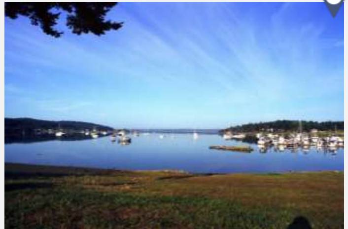
San Juan Islands National Monument