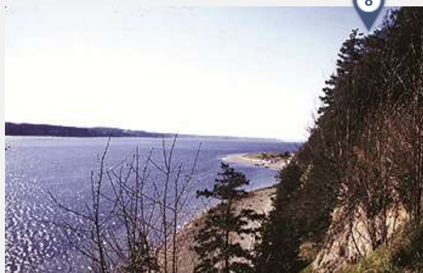
Camano Island State Park (Washington State Parks)