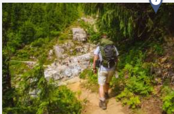
Gothic Basin Trail, Mt. Baker-Snoqualmie National Forest

As you make your way back to Seattle, consider lingering a bit longer in the lush forests of the Mt. Baker-Snoqualmie National Forest and spend the night at the Marble Creek Campground . Or if it is the sand and salt spray of the shore that calls you, enjoy a final night at the beach at Camano Island State Park before returning to the hustle and bustle of the city.