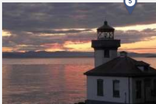
Lime Kiln Point Lighthouse

The journey by ferry continues to San Juan Island. Watch for orca whales from Lime Kiln Point State Park's historic lighthouse and then visit English and American Camps at San Juan Islands National Historical Park . Make a final stop at Orcas Island and Moran State Park for the spectacular view from Mt. Constitution.