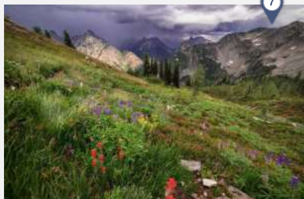
Mt. Baker National Recreation Area