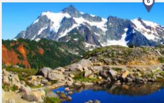
Mt. Baker view from Artist Point, (Christine Madden/Share the Experience)

Back on the mainland, head north to Bellingham and then east up the Mount Baker State Scenic Highway to the Mount Baker National Recreation Area . Mid-summer wildflower blooms and awe-inspiring mountain views draw locals and visitors alike to the alpine wonderlands of Heather Meadows and Artist Point. Serious climbers may arrange for a guide to help them summit Mt. Baker.