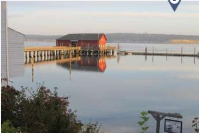
Eby's Landing National Historic Reserve

Catch the Washington State Ferry from Mukiteo to Whidbey Island heading for the quaint seaside community of Coupeville and home of Eby's Landing National Historic Reserve . Travel over the iconic bridge at Deception Pass State Park and on to the port town of Anacortes to catch another ferry along the San Juan Islands State Scenic Byway . First stop is Lopez Island, headquarters of the San Juan Islands National Monument . Hike the trails to Chadwick Hill, Watmough Bay, and Iceberg Point, before beachcombing or camping at Spencer Spit State Park .