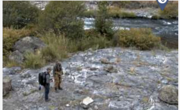
Fly Fishing on the Lower Deschutes River