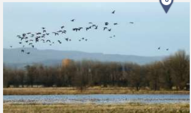
Bird Watching along the Columbia River