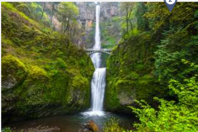
Multnomah Falls, Columbia River Gorge National Scenic Area