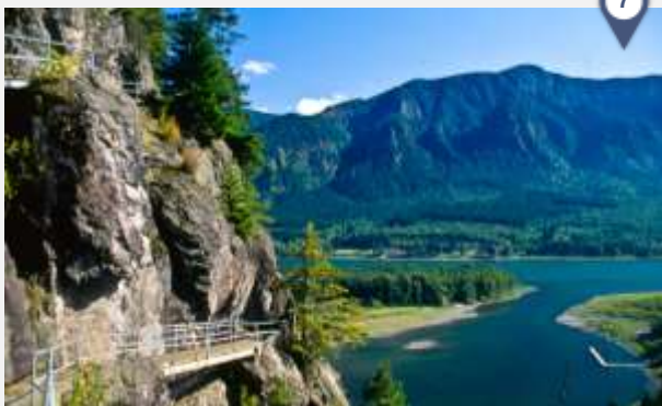
Trail at Beacon Rock State Park

Back in The Dalles, once again cross the Columbia River for a taste of the Gorge's north side on your return to Portland. First stop is the Wild and Scenic White Salmon River for whitewater rafting, kayaking, and picnicking. Then on to Beacon Rock State Park where you can hike to the top of this prominent landmark for a postcard view. Finish your journey at the Steigerwald Lake National Wildlife Refuge for a river's eye view of birds, passing river traffic, and the Gorge's soaring basalt rock walls.