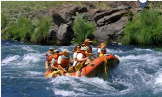
Rafting on the Lower Deschutes River, (Bureau of Land Management)

The route now leads to Maupin where you can access the renowned Deschutes River . Stay at a local guest lodge or go more rustic at one of the riverside campgrounds. Join a whitewater rafting adventure or arrange for a local fly-fishing guide to show you why this river is an on so many angler's bucket list. If you prefer to keep your feet planted on the ground, drive or bike the Deschutes River Backcountry Byway and hike some of the side trails.