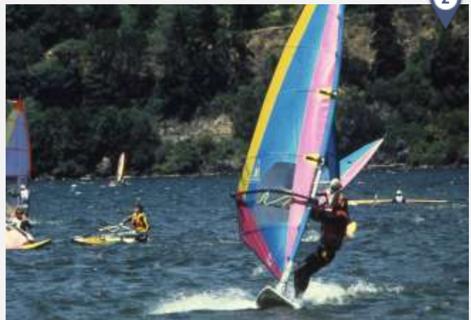
Wind Surfing, Columbia River Gorge National Scenic Area