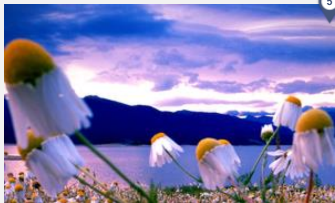
Lake Granby, Arapaho National Recreation Area

Grand Lake, which sits on the edge of the Arapaho National Recreation Area , is one in a series of lakes in the area and is the largest natural lake in Colorado. Lake Granby (pictured right), Shadow Mountain Lake, Monarch Lake, Willow Creek Reservoir and Meadow Creek Reservoir make this area a boater's paradise.