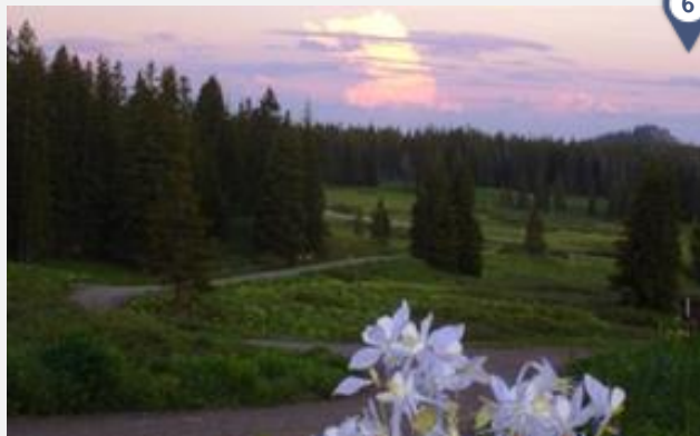
Dumont Campground, Routt National Forest