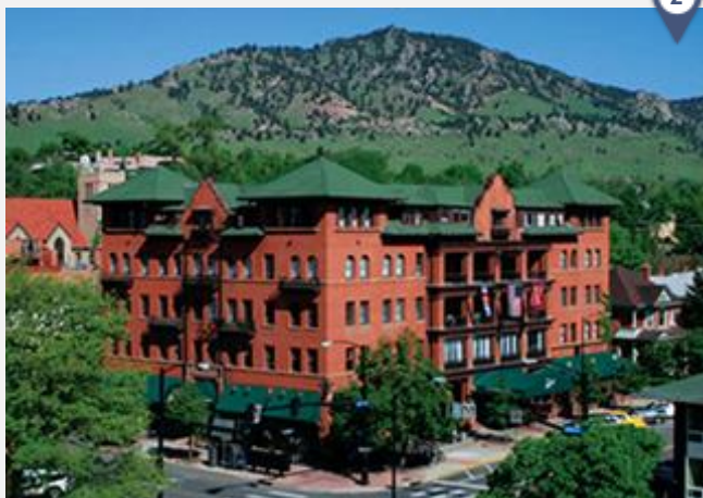
Hotel Boulderado Boulder, CO

Hotel Boulderado in Boulder and The Stanley in Estes Park are on the National Register of Historic Places and part of the Historic Hotels of America . Both hotels offer charm and luxury accommodations.