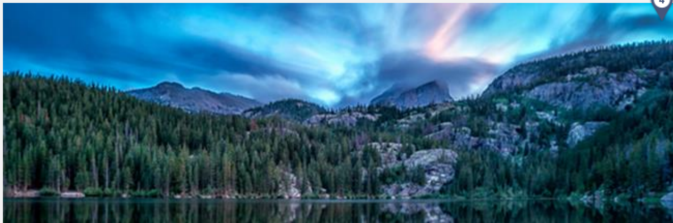
Rocky Mountain National Park

Rocky Mountain National Park is the scenic route in spades. Make a reservation at Aspenglen , Glacier Basin or Moraine Park campgrounds; ride over Trail Ridge Road; enjoy over 300 miles/483 km of trails; and take in the spectacular views of high-alpine peaks, wildlife and wildflowers.