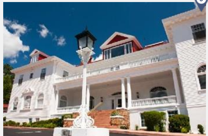
The Stanley Estes Park, CO