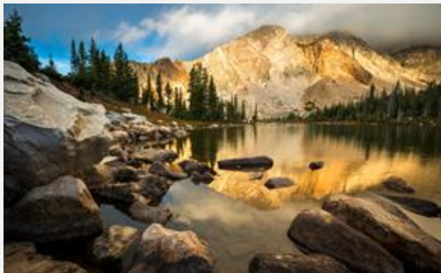
Routt National Forest

There is plenty to do and see on Routt National Forest. The Dumont Campground (right) is on the way to Steamboat Springs.