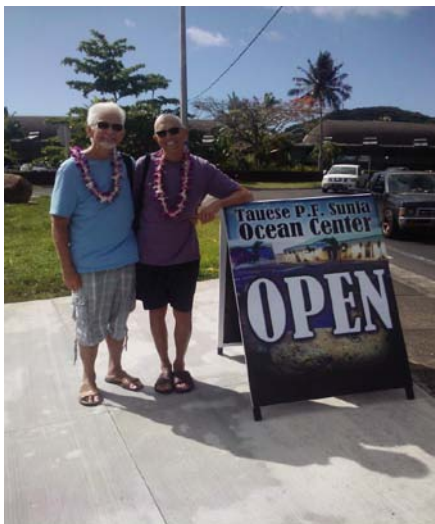
Cruise ship passengers visiting the Ocean Center.