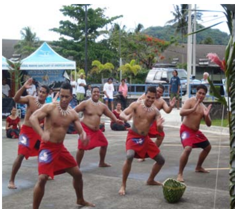
Traditional Performances

The Festival of Sites is the first of many planned visitor programs lead by the National Marine Sanctuary of American Samoa.