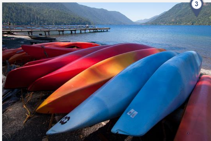
Crescent Lake, Olympic National Park

Stop at Port Angeles to visit the Olympic National Park Visitor Center. Continue into the park for sweeping views from Hurricane Ridge and the cool beauty of Crescent Lake. Take a side trip via the Strait of Juan de Fuca National Scenic Byway and the Cape Flattery Tribal Scenic Byway to Neah Bay and Makah Indian Reservation. Take in some of the culture at the Makah Museum before returning to Highway 101.