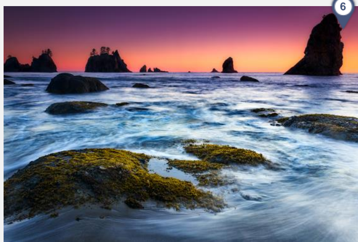
View of Olympic National Marine Sanctuary from Olympic National Park

Continue south on the Pacific Coast Scenic Highway to the Hoh Rain Forest and Kalaloch Beach and Lodge within the Olympic National Park. While you are there, take in the views of the Olympic Coast National Marine Sanctuary . Visit the Olympic National Forest's Lake Quinault area including the Lake Quinault Lodge and old-growth forest trails. Complete the loop back to Seattle with a stop east of Olympia at the Nisqually National Wildlife Refuge for an intimate look at the southern tip of the Puget Sound. This refuge was established to provide habitat for migratory birds and is important habitat for many bird species.