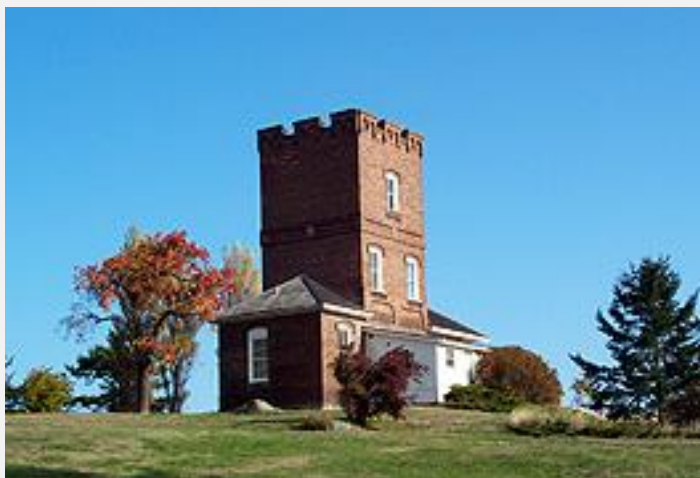
Fort Worden Historical State Park, Washington State Parks

Start your journey with a quintessential experience aboard one of the Washington State Ferries to the Kitsap Peninsula and on to the Olympic Peninsula, Port Townsend, and historic Fort Worden Historical State Park along State Route 104/US Highway 101 West. Travel the Pacific Coast Scenic Byway, stopping at the Dungeness National Wildlife Refuge to walk the Dungeness Spit and take a tour one of the daily tours of the Dungeness Lightstation .