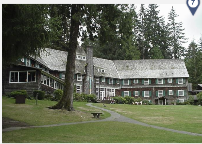
Lake Quinault Lodge Olympic National Forest, US Forest Service