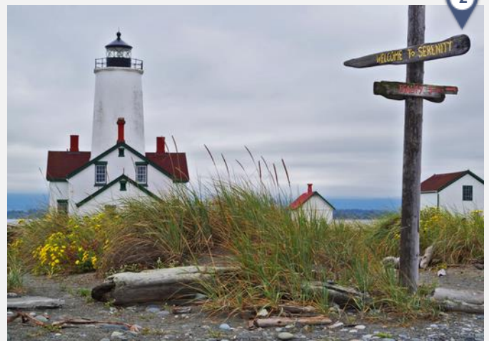
Dungeness National Wildlife Refuge Lightstation