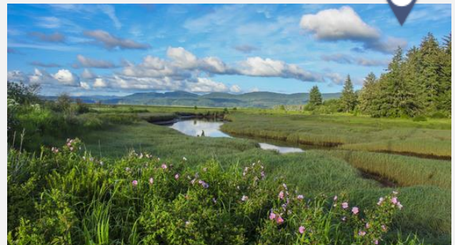
Willapa National Wildlife Refuge