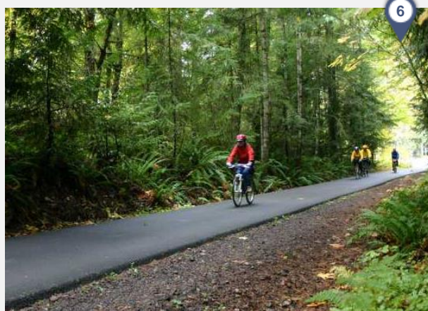
Banks-Veronia State Trail (Oregon State Parks)