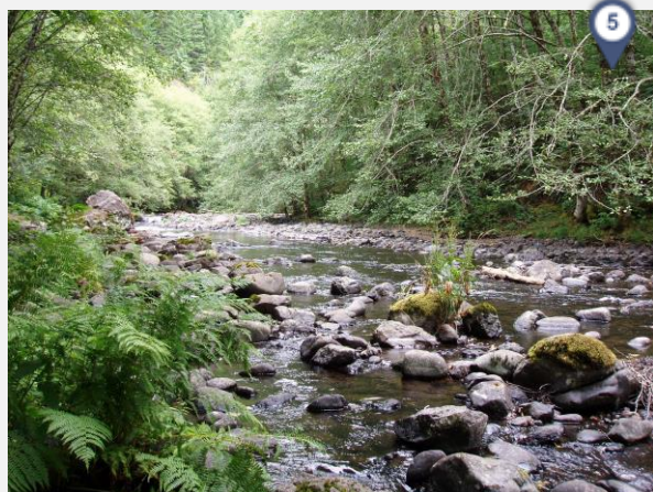
Elk Creek (Tillamook State Forest)

Circling back towards Portland, let the green canopy of the Tillamook State Forest envelop you as you stop for a picnic or climb to the top of a towering fire lookout. Nearby, embark on a hike at L.L. Stub Stewart State Park or ready yourself for a bicycle tour of the countryside. The Portland area is known as a cycling hub and Banks-Veronia State Trail and the Tualatin Valley Scenic Bikeway will not disappoint.