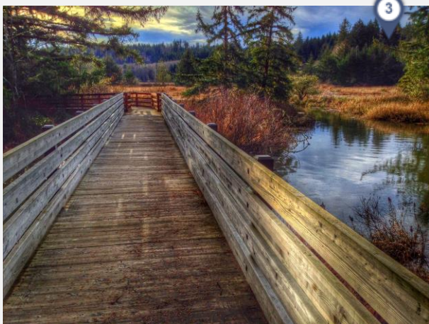
Lewis and Clark National Historical Park

Traveling along the Pacific Coast Scenic Byway , discover the stories of USA's most famous explorers at Lewis and Clark National Historical Park . While in the area, Cape Disappointment State Park's lighthouses and the Lewis and Clark Interpretive Center are wonderful sites for the entire family to enjoy. Continue south to Cape Meares National Wildlife Refuge , home of the largest Sitka spruce tree and where wildlife abounds in this old-growth coastal headland.