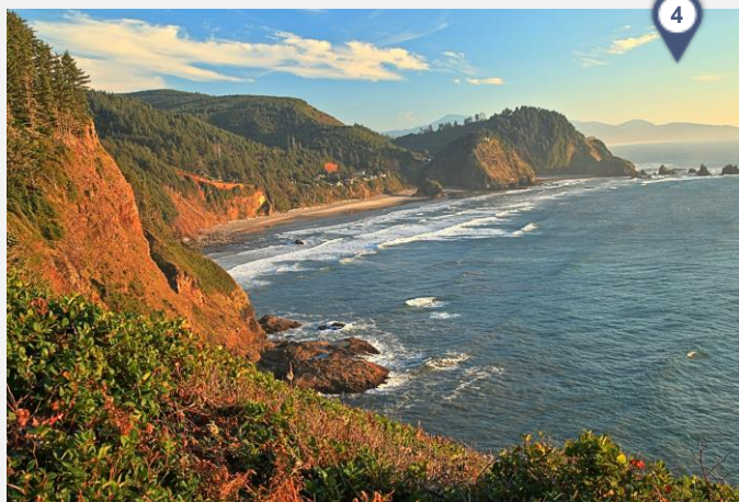
Cape Meares National Wildlife Refuge