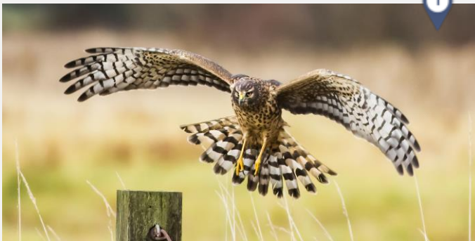
Northern Harrier, Ridgefield National Wildlife Refuge

Just minutes from the Portland area, tour the Ridgefield National Wildlife Refuge to view coastal forests, sloughs and wetlands which support a variety of wildlife like raptors, river otter and black-tailed deer. Visit the refuge's replica Native American Plankhouse and discover what life was like in a Chinookan town. Heading west, travel the Lewis and Clark Trail State Scenic Byway along the Columbia River to the Long Beach Peninsula and Willapa Bay National Wildlife Refuge . Willapa Bay's wildlife and landscapes make each visit to the refuge an experience to remember.